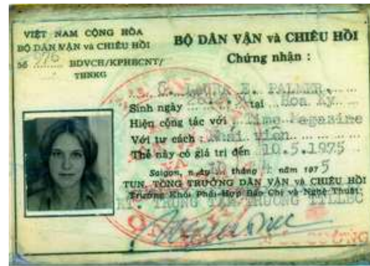
Vietnamese ID card