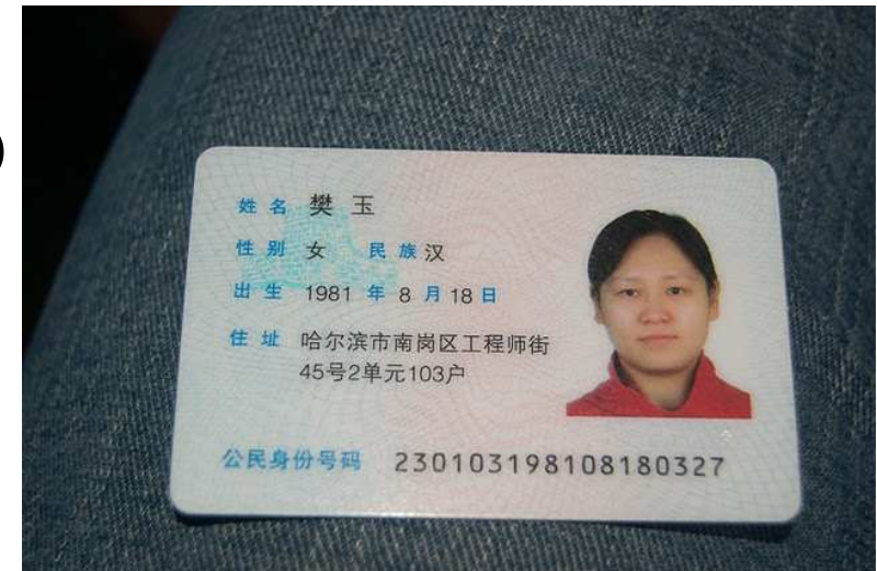
Chinese ID card

Recent „Golden Projects” include development of nationwide population database